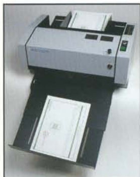
Imprinter with hopper fully extended